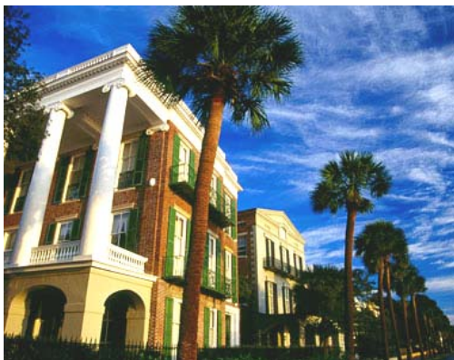
Beautiful Charleston, SC